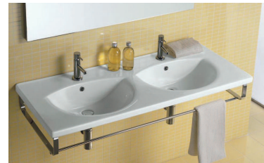
Basin Waste Water