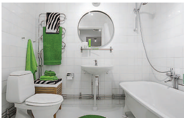
Bathroom & Toilet Waste Water

Now a Days gray Water reuse is Common and regularly procedure, but with conventional treatment unit it is very difficult to reuse the gray Water. Conventional Treatment Systems Requires Very large space, energy & Chemicals so It is not possible to make reuse by conventional means. Utopia Nano Electrochemical device and Membrane Filtration unit are the Heart of the System